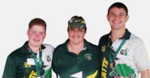
WESTRAND 1 GOLD