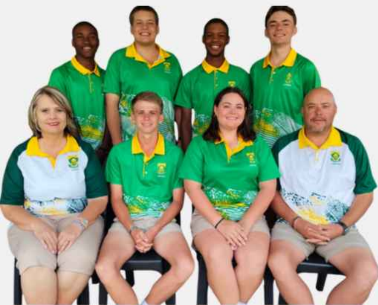
SA BOYS U/19