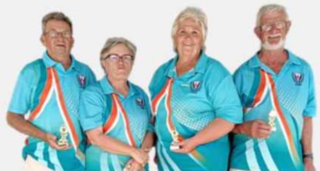
PLATE DIVISION WINNERS SEDIBENG