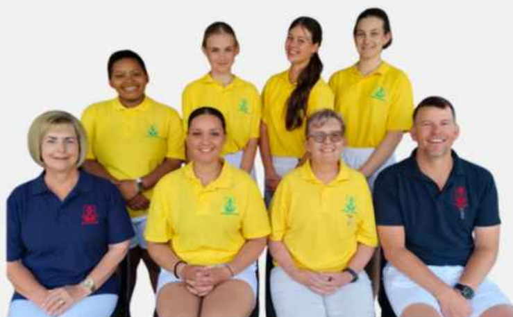
SA ACADEMIC INVITATIONAL GIRLS