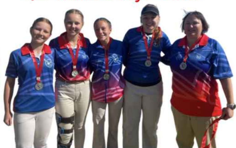
U/19 Namibia Girls- Silver