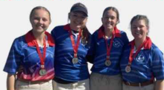
U/30 Women - Silver