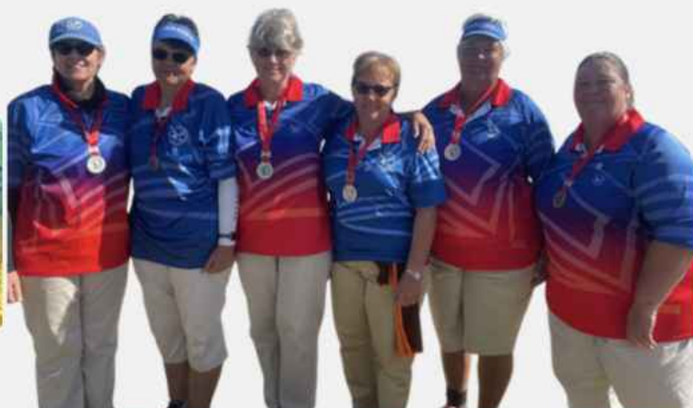
Namibia women above 50 - Silver