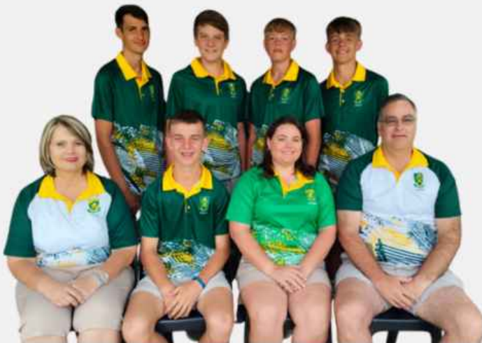
SA BOYS U/16