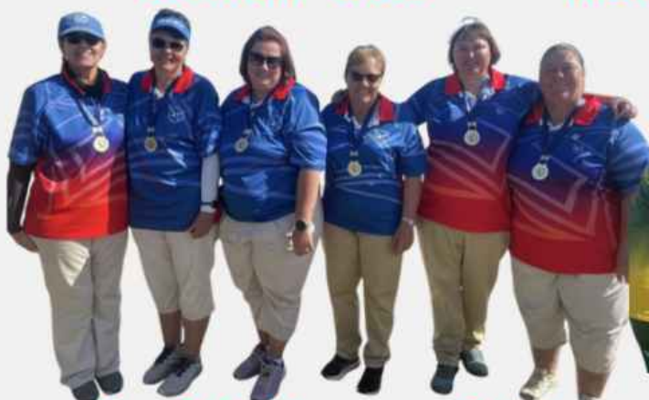
Namibia Women - Gold