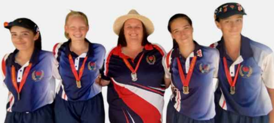
EASTERN GAUTENG BRONZE