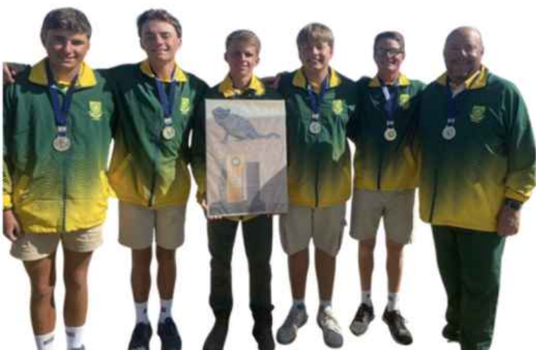
U/19 SA Boys- Gold