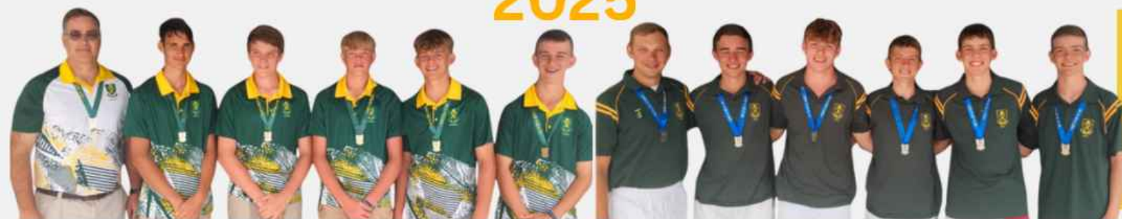
SA BOYS U/16