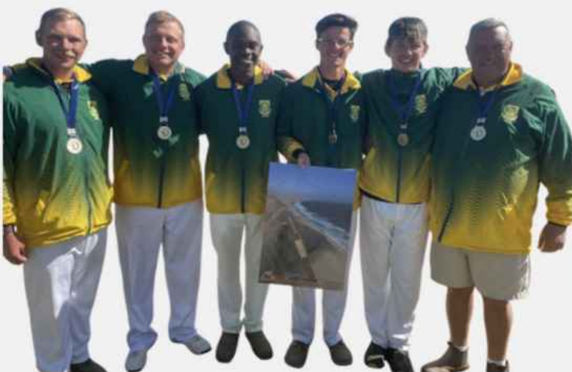
U/30 SA Men - Gold