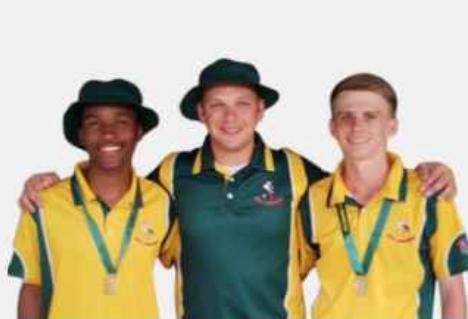
NORTHERN FREESTATE GOLD