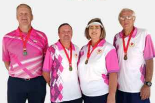
BRONZE EASTERN GAUTENG