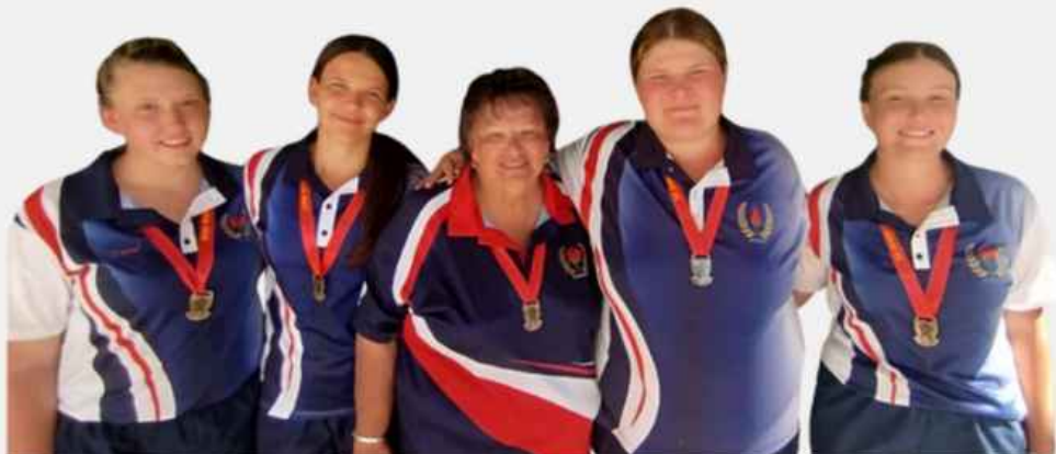
EASTERN GAUTENG BRONZE