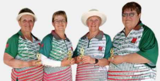
PLATE DIVISION WINNERS NORTHWEST