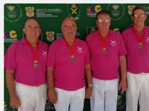
BRONZE SOUTHERN FREE STATE