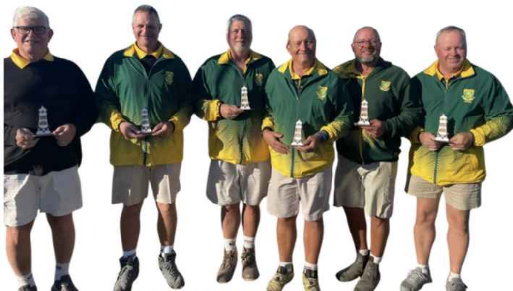
SA MEN ABOVE 50 BRONZE