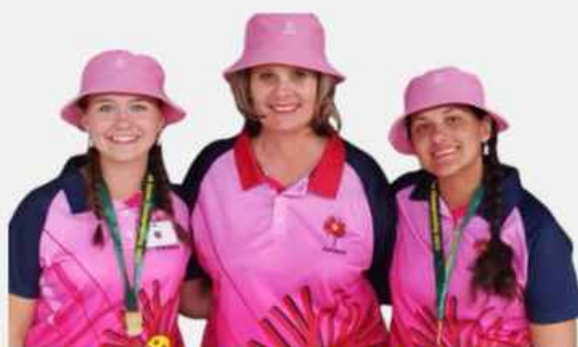
GAUTENG NORTH GOLD