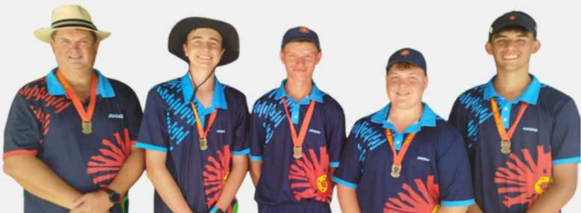
GAUTENG NORTH BRONZE