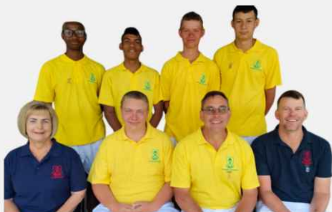
SA ACADEMIC INVITATIONAL BOYS