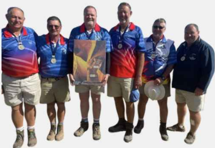
Namibia Men above 50 - Gold