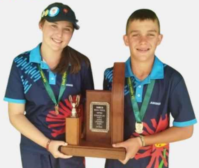
GAUTENG NORTH BOYS AND GIRLS U/13