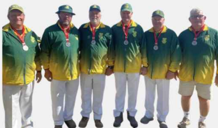
SA Men above 50 - Silver