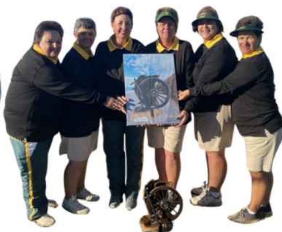
WOMENS CHAMPIONSHIP ABOVE 50 SA WOMEN