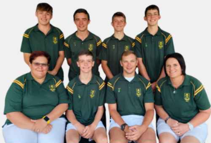
SA-A BOYS U/16