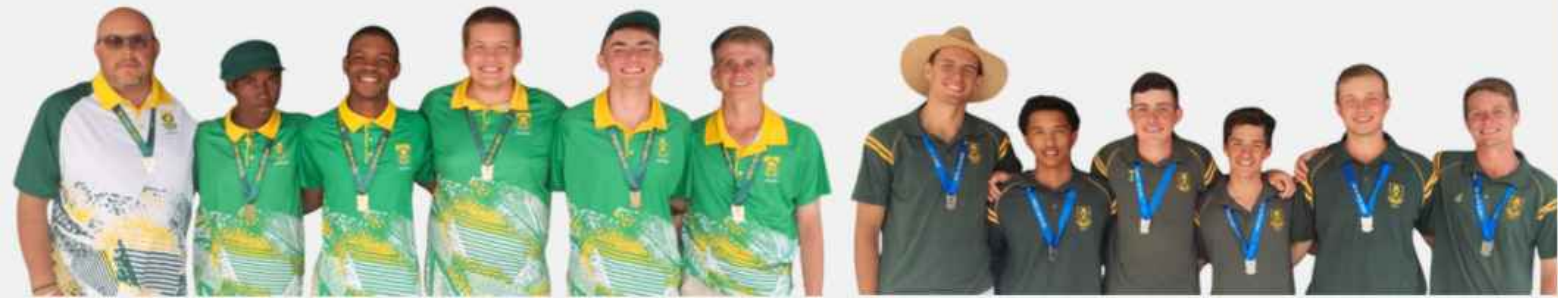
SA BOYS U/19 GOLD