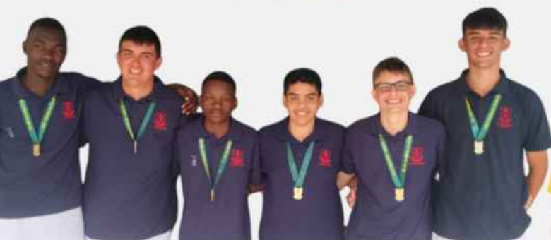
SA ACADEMIC BOYS GOLD