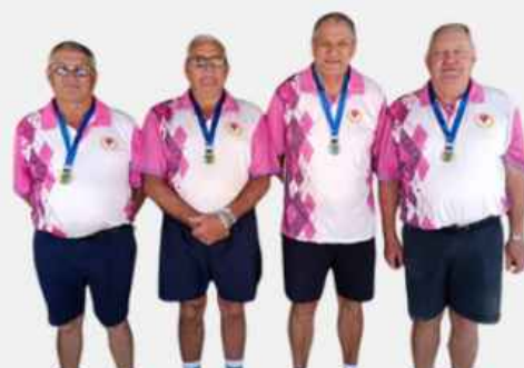
SILVER EASTERN GAUTENG