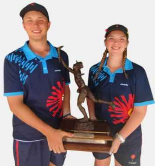
GAUTENG NORTH BOYS AND GIRLS U/19