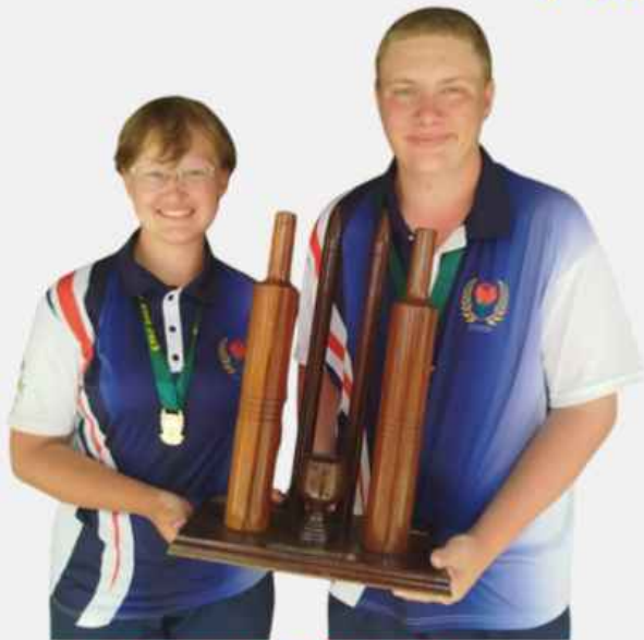
EASTERN GAUTENG BOYS AND GIRLS ACADEMIC