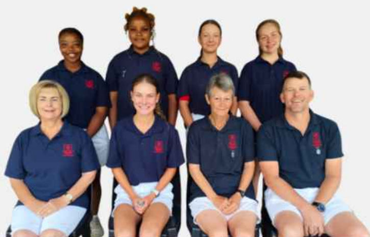
SA ACADEMIC GIRLS