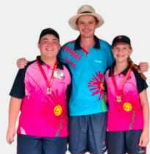
GAUTENG NORTH BRONZE