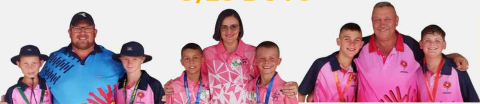
GAUTENG NORTH 2 GOLD