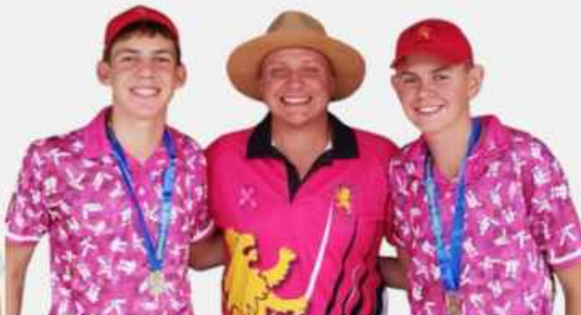
CENTRAL GAUTENG SILVER