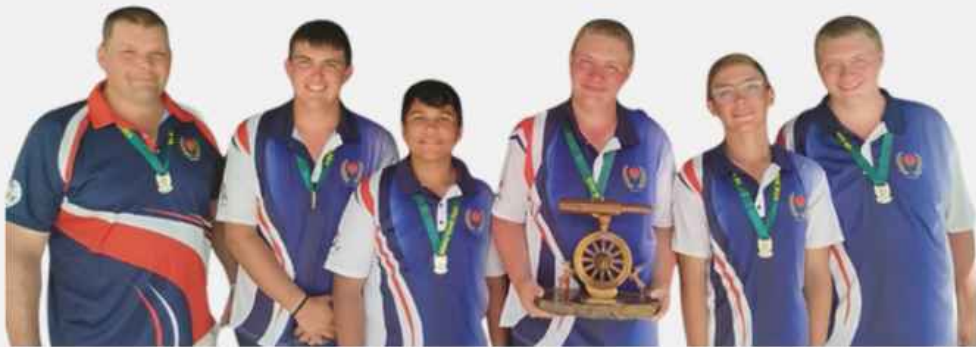
EASTERN GAUTENG GOLD