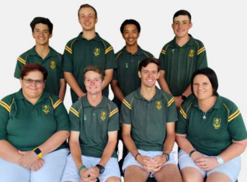
SA-A BOYS U/19