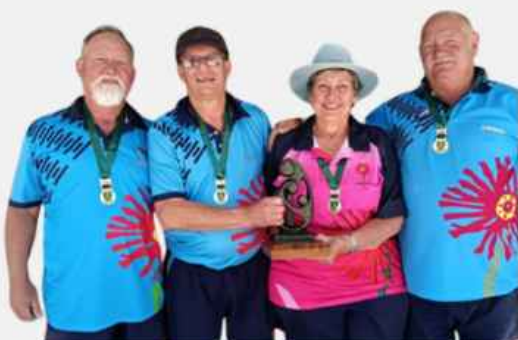
GOLD GAUTENG NORTH