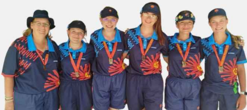
GAUTENG NORTH BRONZE