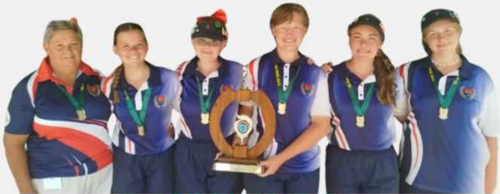
EASTERN GAUTENG GOLD