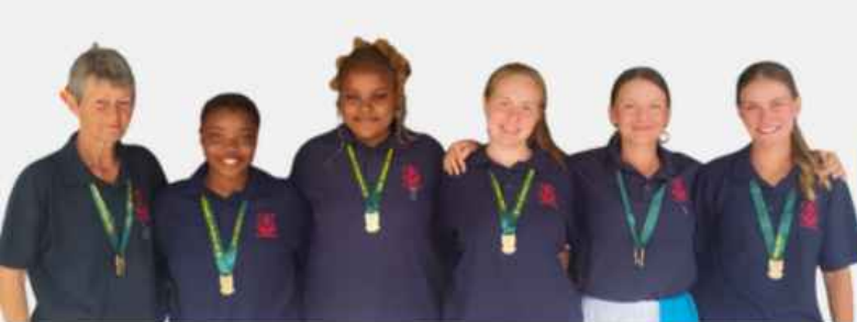
SA ACADEMIC GIRLS GOLD