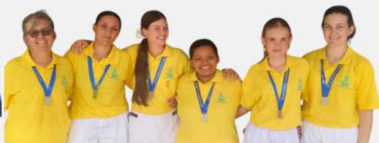
SA ACADEMIC INVENTATION GIRLS SILVER