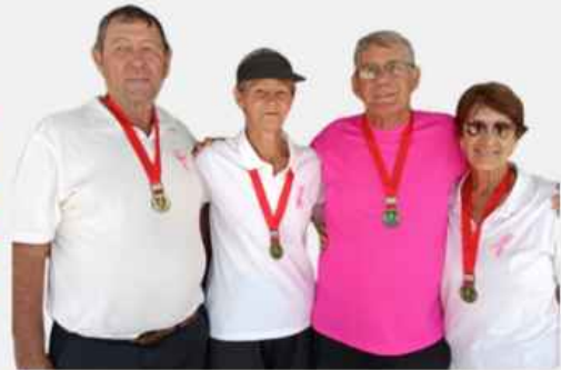
BRONZE KWA-ZULU NATAL