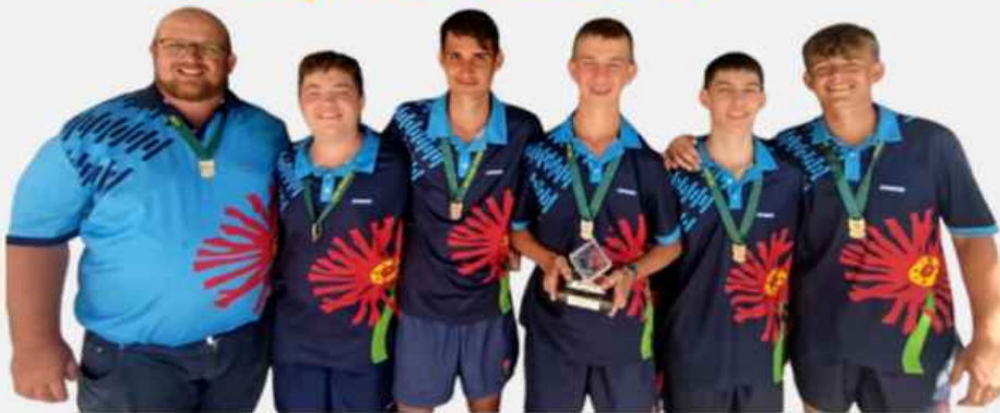
NORTHERN GAUTENG GOLD