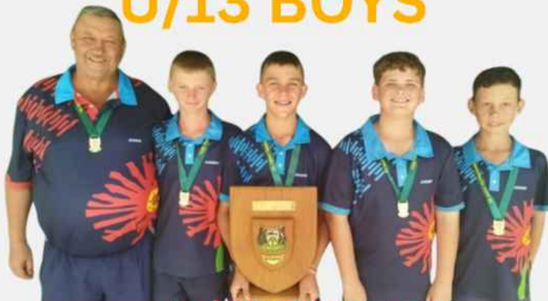
NORTHERN GAUTENG GOLD