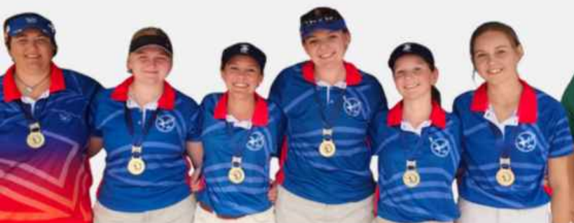
NAMIBIA GIRLS U/19 GOLD