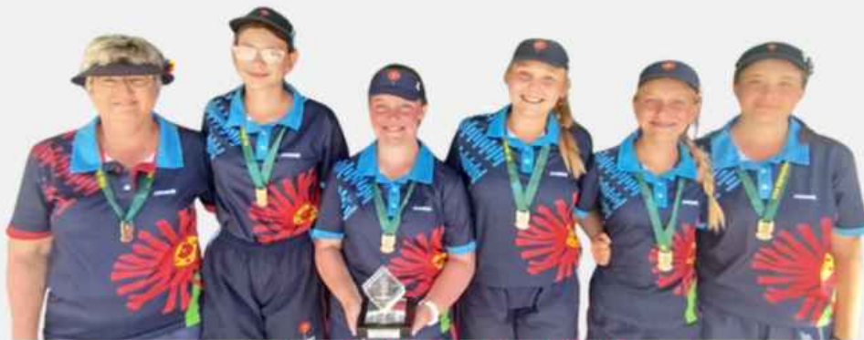
NORTHERN GAUTENG GOLD