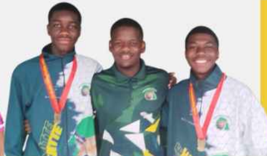
WESTRAND 2 BRONZE