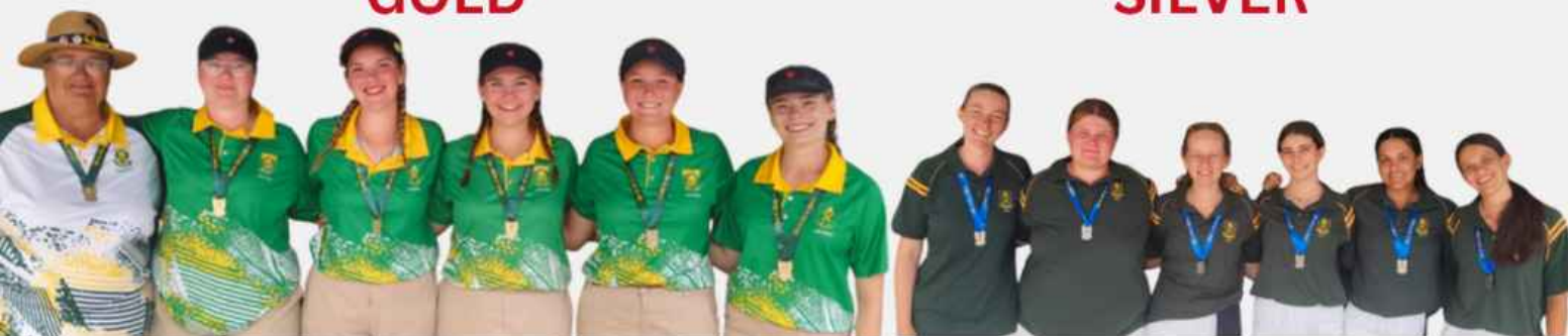
SA GIRLS U/19