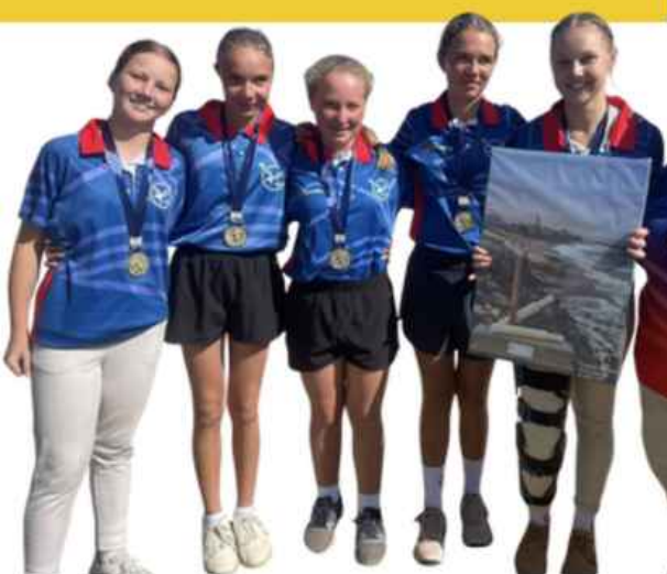
U/16 Namibia Girls- Gold