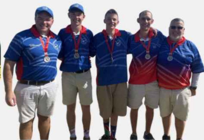
U/30 Namiba Men - Silver