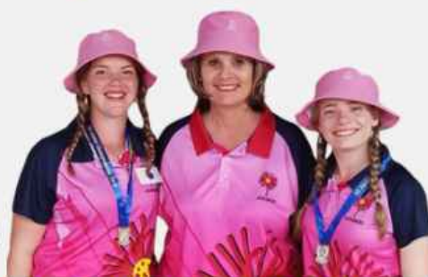
GAUTENG NORTH SILVER