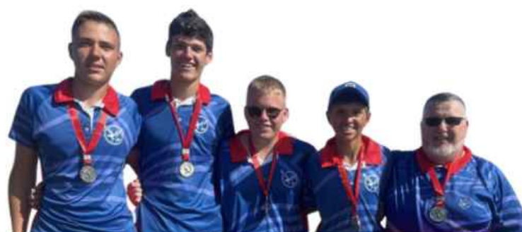
U/16 Namibia Boys - Silver