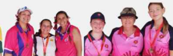
MPUMALANGA & GAUTENG NORTH BRONZE