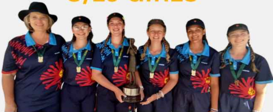
NORTHERN GAUTENG GOLD