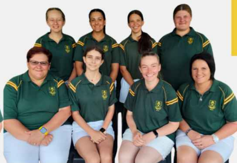
SA-A GIRLS U/19