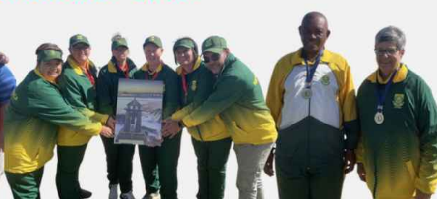
SA Women- Silver