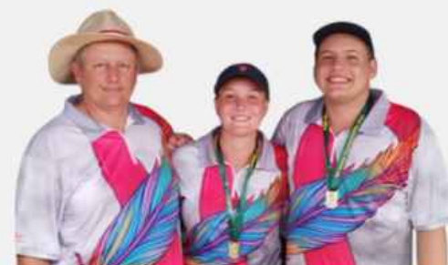
EASTERN GAUTENG GOLD