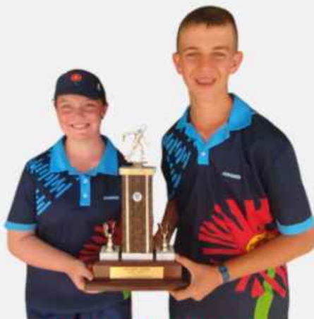
GAUTENG NORTH BOYS AND GIRLS U/16