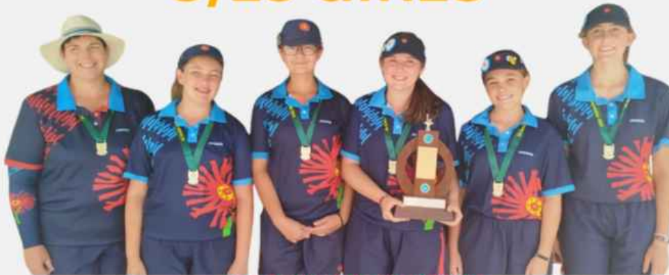
NORTHERN GAUTENG GOLD