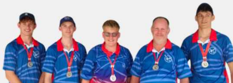
NAMIBIA BOYS U/19 SILVER