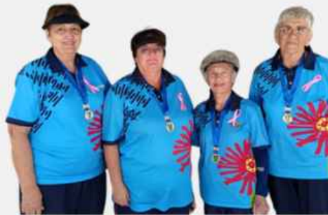
SILVER GAUTENG NORTH