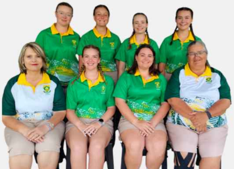
SA GIRLS U/19