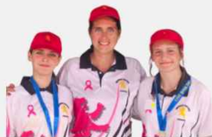
CENTRAL GAUTENG BRONZE