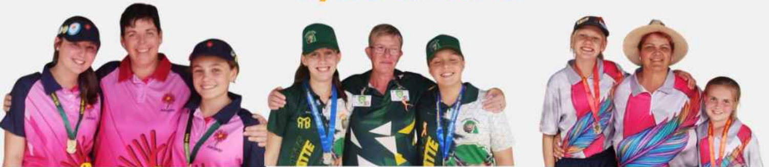
GAUTENG NORTH GOLD