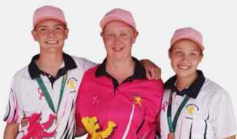
CENTRAL GAUTENG GOLD