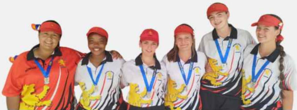
CENTRAL GAUTENG SILVER