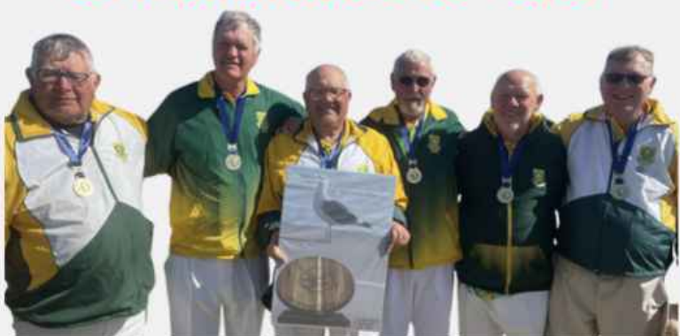
SA Men above 60 - Gold