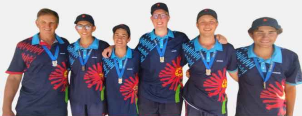
GAUTENG NORTH SILVER