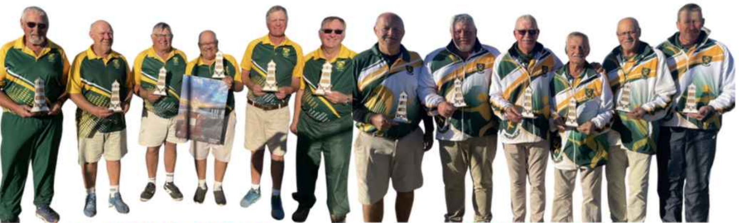
SA MEN ABOVE 60 GOLD