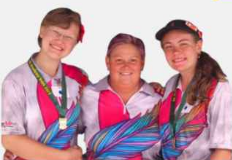
EASTERN GAUTENG GOLD