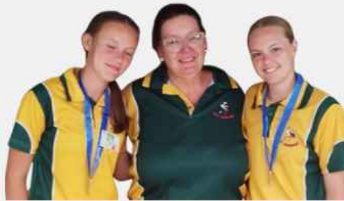
NORTHERN FREESTATE SILVER