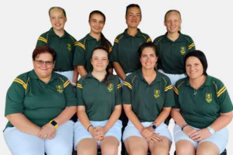
SA-A GIRLS U/16