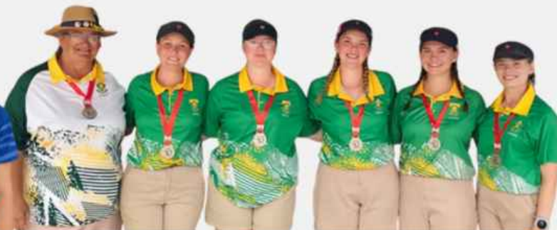
SA GIRLS U/19 SILVER