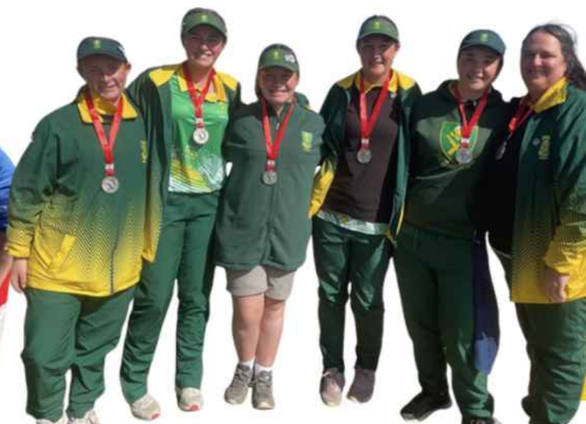
U/16 SA Girls - Silver