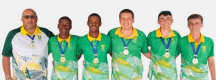
SA BOYS U/19 GOLD