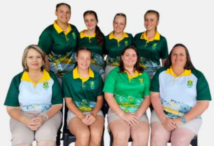
SA GIRLS U/16