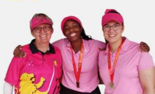
CENTRAL GAUTENG BRONZE