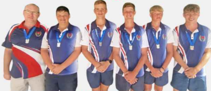
EASTERN GAUTENG SILVER