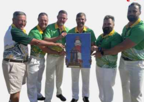
SA Men - Gold