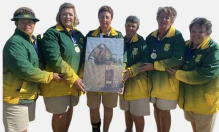
SA Women above 50 - Gold