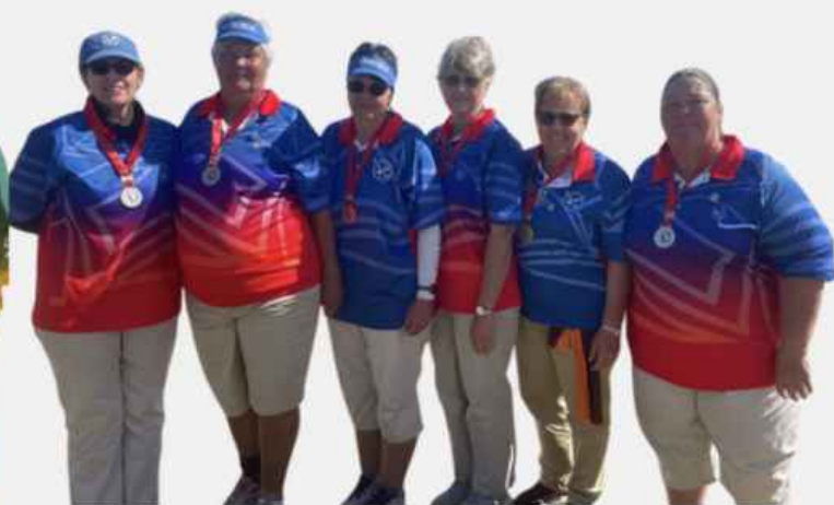
Namibia Men above 60 - Silver