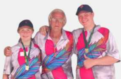
EASTERN GAUTENG GOLD