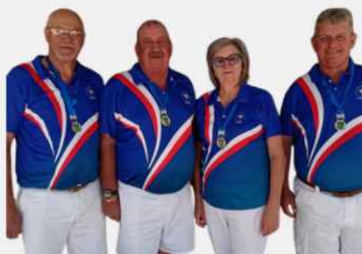
SILVER NORTHERN CAPE