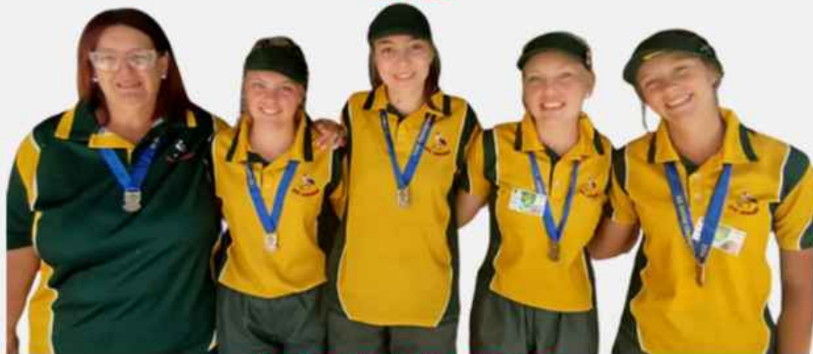
NORTHERN FREESTATE SILVER