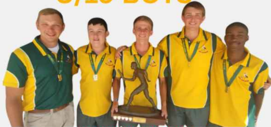
NORTHERN FREESTATE GOLD