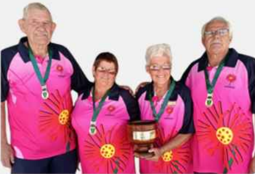
GOLD GAUTENG NORTH