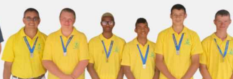
SA ACADEMIC INVENTATION BOYS SILVER