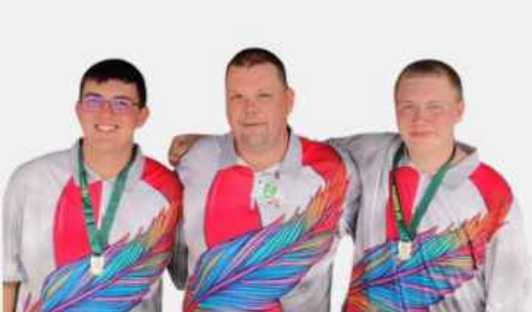
EASTERN GAUTENG GOLD