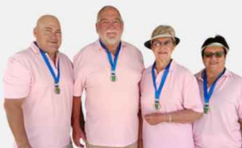
SILVER NORTH WEST