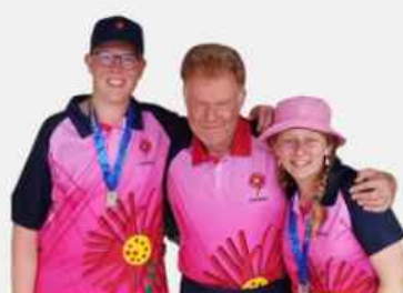
GAUTENG NORTH SILVER