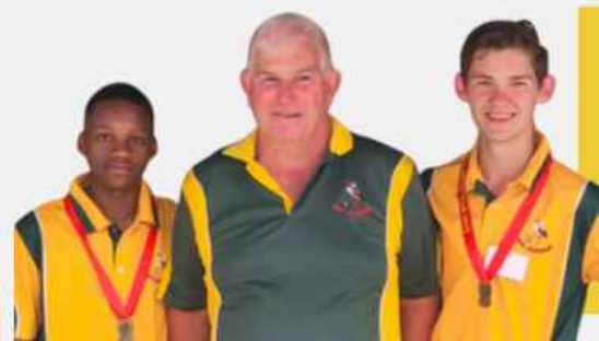
NORTHERN FREESTATE BRONZE