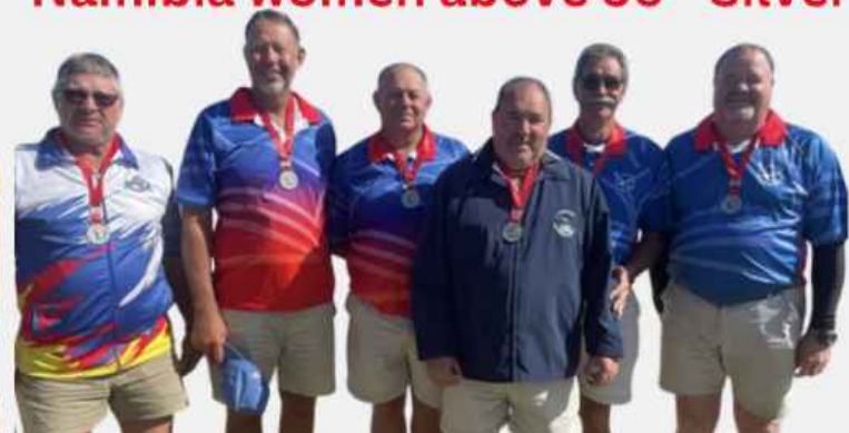
Namibia Men above 60 - Silver