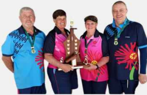
GOLD GAUTENG NORTH