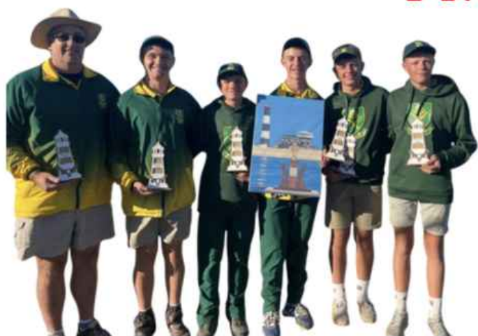
SA U/16 BOYS GOLD