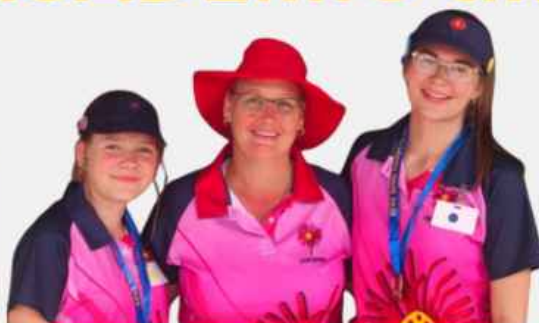
GAUTENG NORTH SILVER