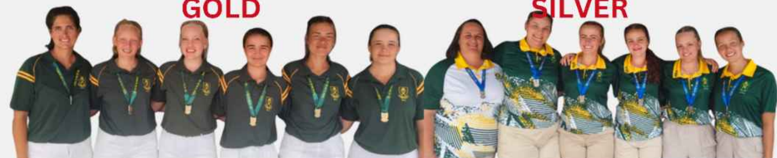
SA-A GIRLS U/16