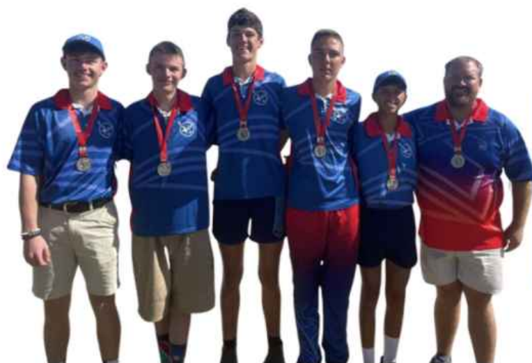
U/19 Namibia Boys - Silver