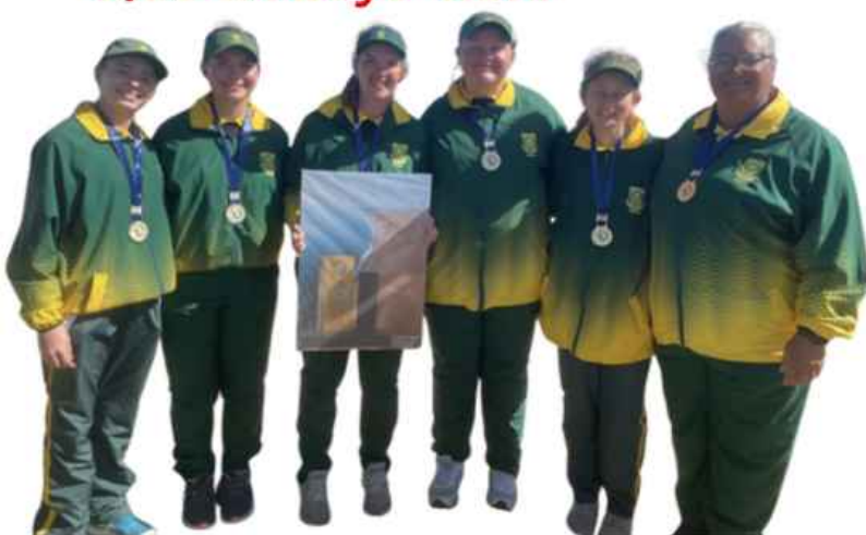
U/19 SA Girls - Gold