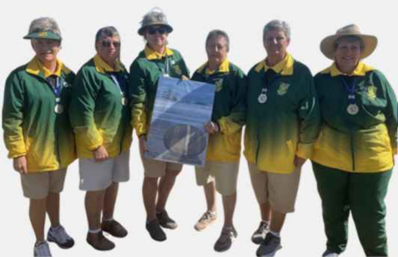
SA Women above 60 - Gold