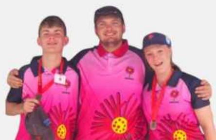
GAUTENG NORTH BRONZE