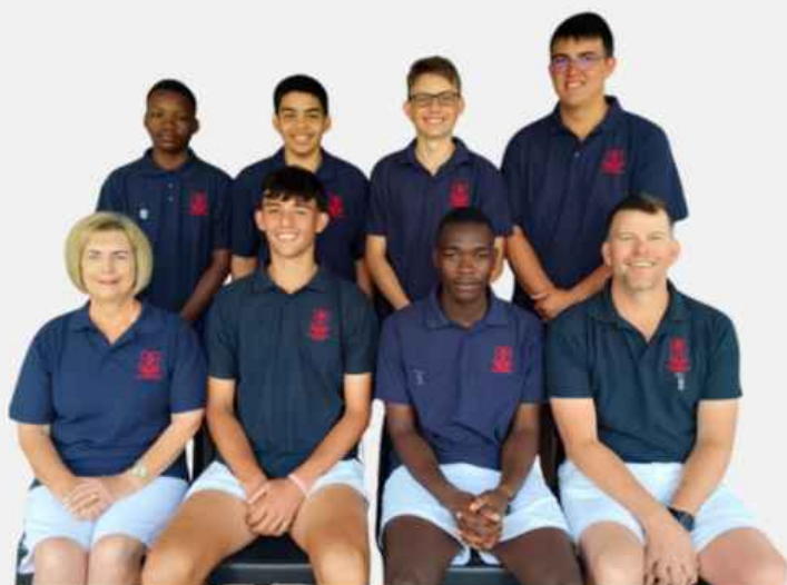
SA ACADEMIC BOYS