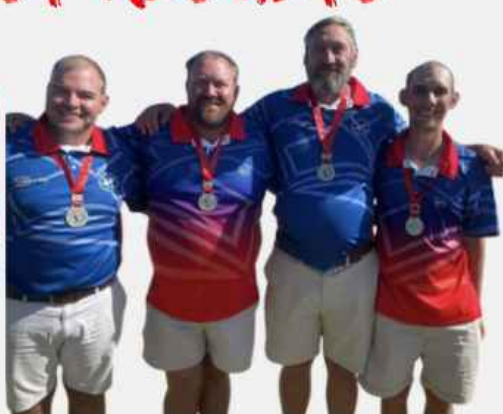
Namibia Men - Silver