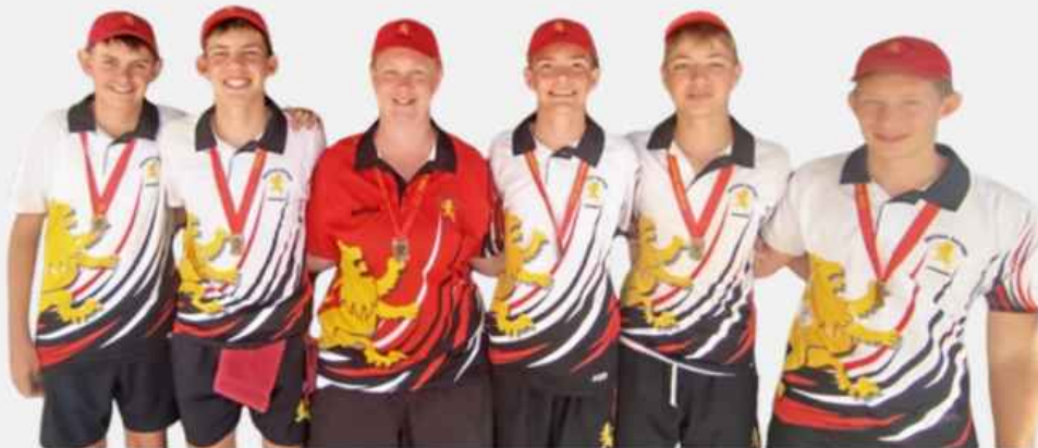
CENTRAL GAUTENG BRONZE