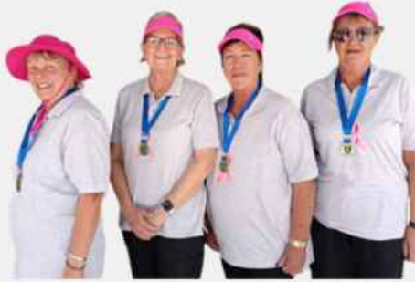
SILVER NELSON MANDELA BAY